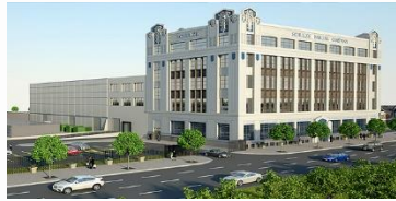
CHICAGO 40 E. Garfield Boulevard