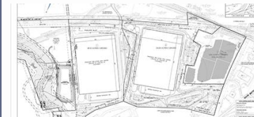
CHESTER COUNTY Pennsylvania