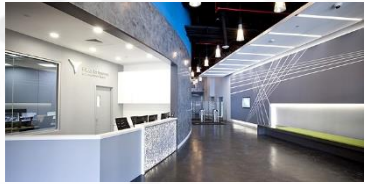
NEW YORK 1 RAMLAND ROAD