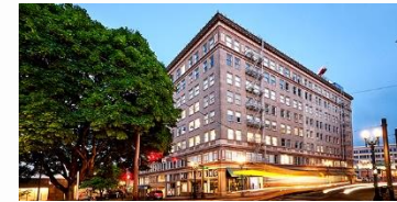
PORTLAND 921 SW Washington Street