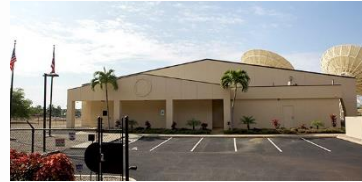
KAPOLEI 91-340 Farrington Highway