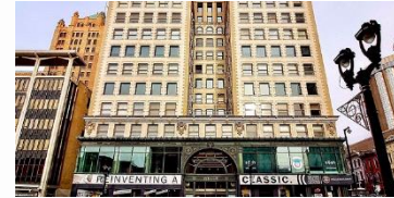
MILWAUKEE 324 E. Madison Avenue