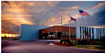
CHEYENNE 340Progress Circle