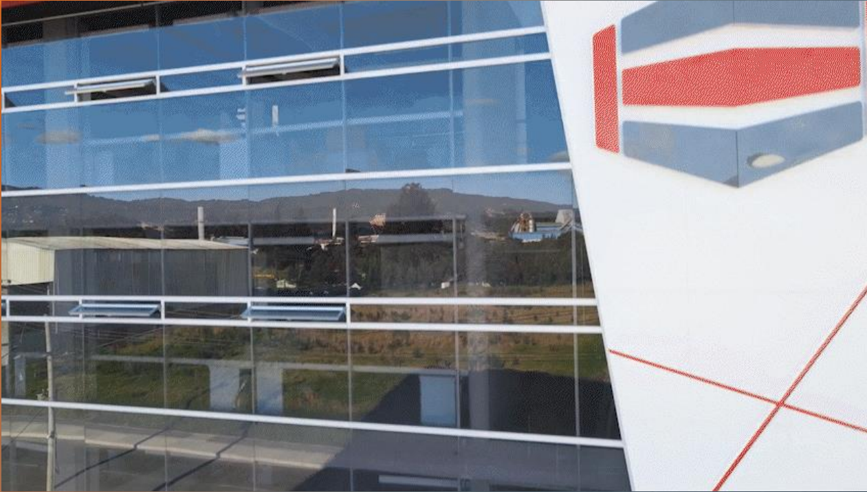
New Bogota, Colombia Tier IV Data Center