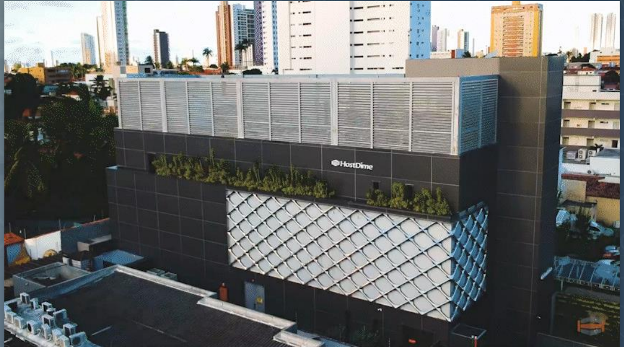
João Pessoa, Brazil Data Center